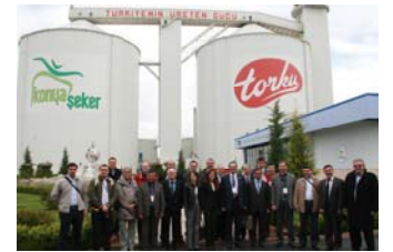
Visit to Çumra Sugar Factory