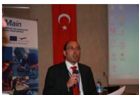
Leonardo explains the European Strategy 2020