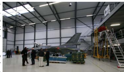
Visiting the hangar workshop

Markiezaat College is accredited to give the European certification for maintenance: it is one of the few centers authorized for doing it.