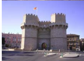
Some images of Valencia, the city of light and music

The last meeting of the Leonardo Partnership InnMain will be held in Valencia, Spain, on the 9 th , 10 th and 11 th of May 2012.