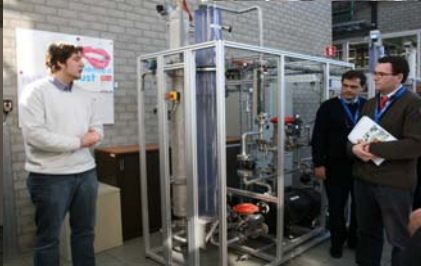
Some students explained the workshops

all the participants agreed on this statement: this activity was the best one of the whole meeting: the students are a living example of the educational work done in Markiezaat.